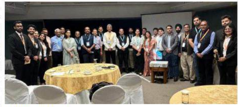
Dignitaries pose for group photograph.

Roundtable 1.0 focused on two main topics: "Exploring Industry's Expectations from a B-School" and "Discussing Avenues of Collaboration Between Industry and Academia." These discussions were moderated by dedicated panel leaders, ensuring a structured and in-depth ex-