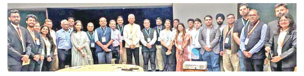
STATE TIMES NEWS

By Statetimes_editor Last updated Jun 2, 2024