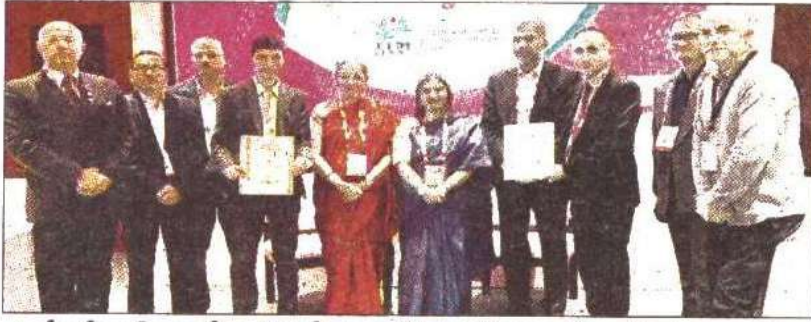
आईआईएम-निफ्ट श्रीनगर के बीच समझौते के मौके पर अधिकारी।

जम्मू। शैक्षणिक सहयोग एवं नवाचार को बढ़ावा देने की दिशा में आईआईएम ने महत्वपूर्ण कदम उठाया है। आईआईएम ने और राष्ट्रीय फैशन प्रौद्योगिकी संस्थान श्रीनगर एक समझौता ज्ञापन हस्ताक्षरित किया है। नई दिल्ली में आयोजित प्रतिष्ठित अंतरराष्ट्रीय उद्योग मंच, भारत टेक्स 2024 में ऐसा किया गया है। यह एक ऐसा मंच है जो प्रदर्शनियों, ज्ञान सत्रों, विषयगत चर्चाओं, सरकार-से-सरकार (जी2जी) बैठकों, बिजनेस-टू-बिजनेस (बी2बी) नेटवर्क की जानकारी देता है।