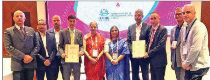
IIM Jammu and NIFT Srinagar representatives during MoU signing ceremony.

The IIM Jammu, established in 2016, is an Institute