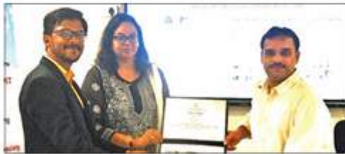
IIM Jammu faculty during a programme.