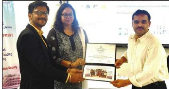
One of the participants receiving the certificate at IIM Jammu.

Following his address, participants had the opportunity to share their feedback and reflections on the program. Their testimonials echoed